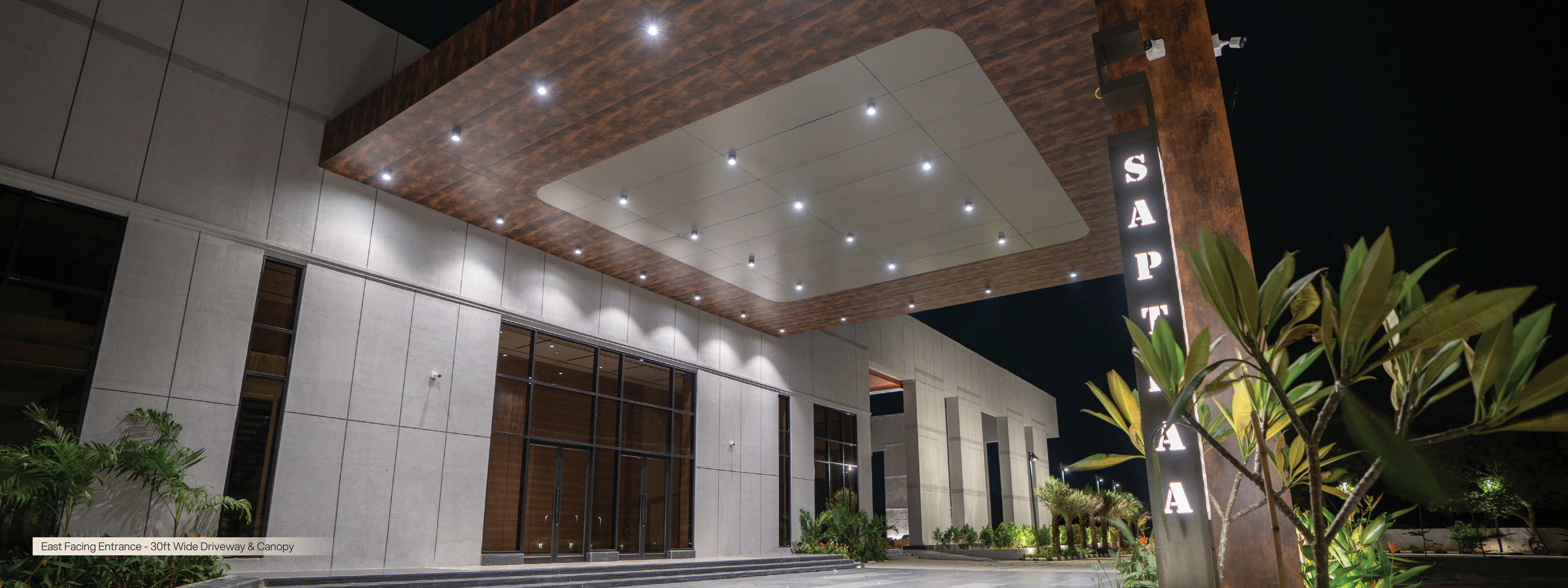
East Facing Entrance - 30ft Wide Driveway & Canopy