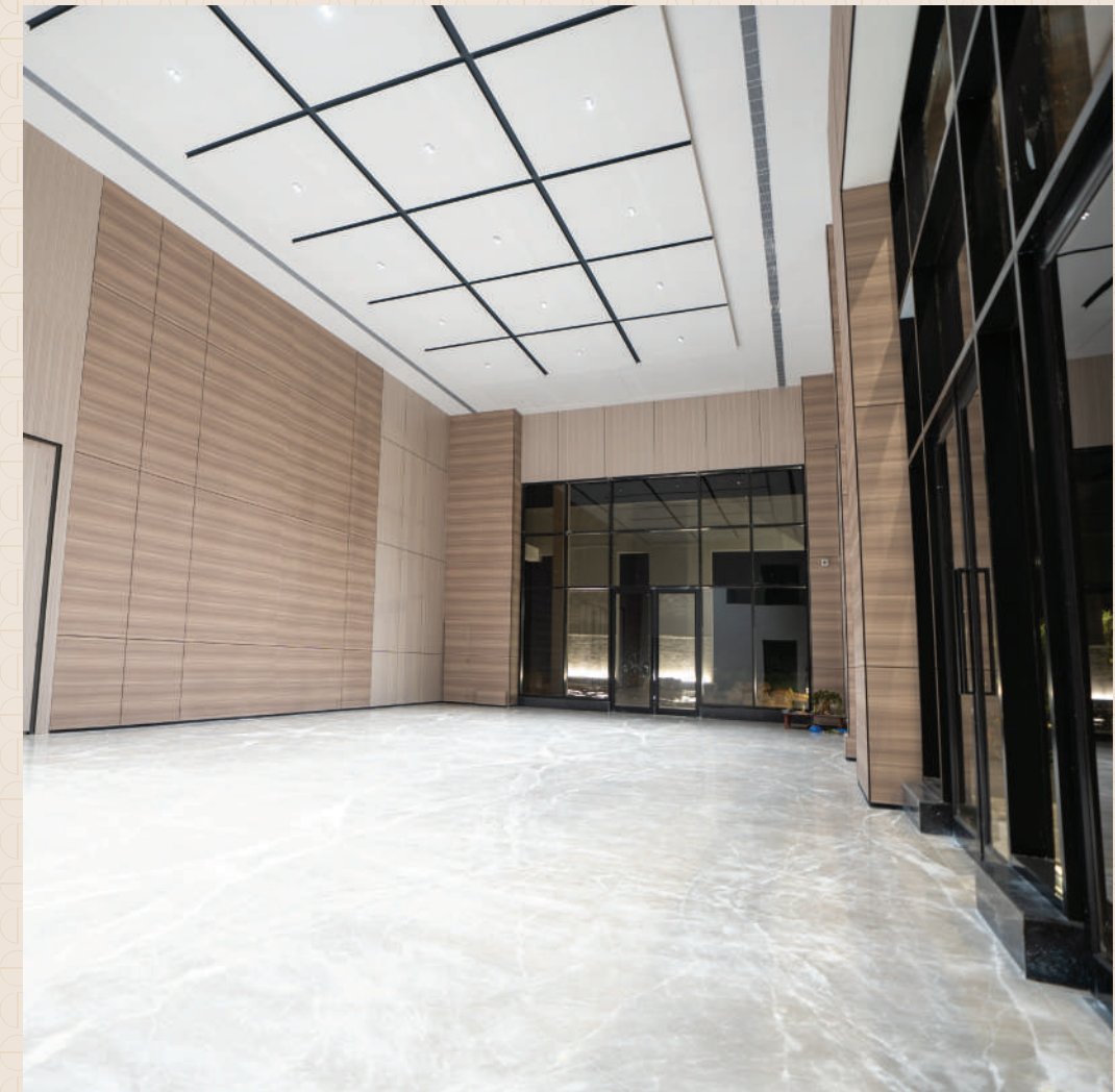
2000 SFT WELCOME ZONE