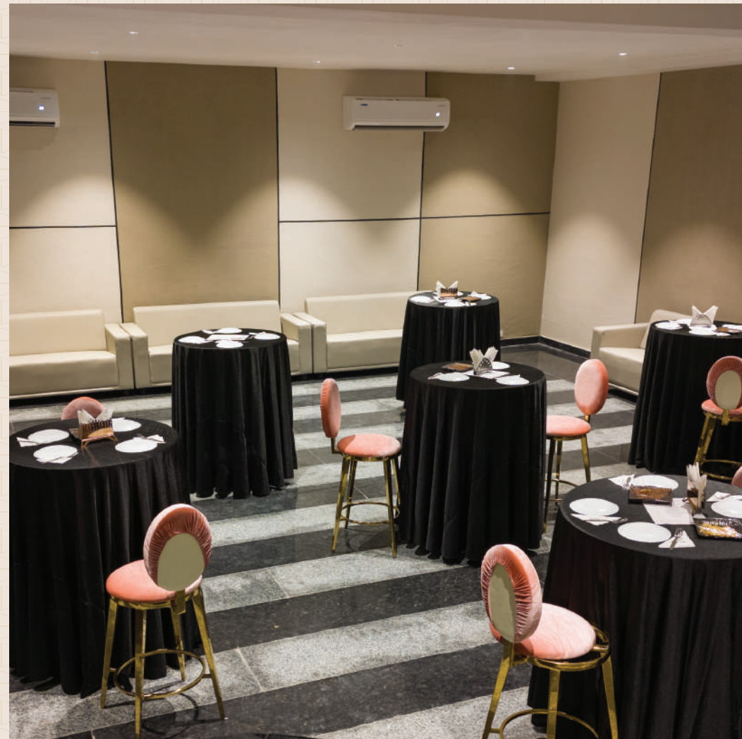
1910 SFT PRIVATE MEZZANINE (VIP DINING)