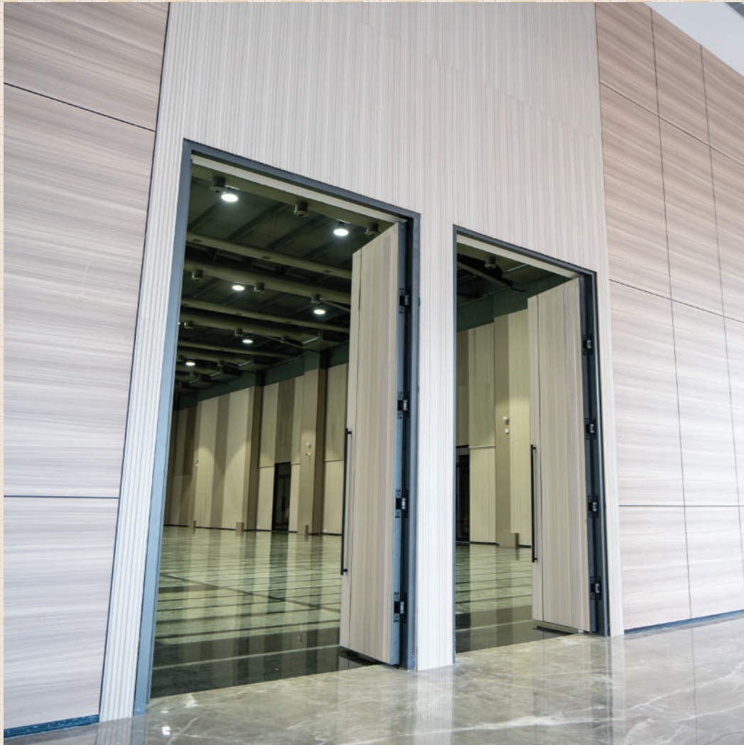
12 FT ENTRY DOOR