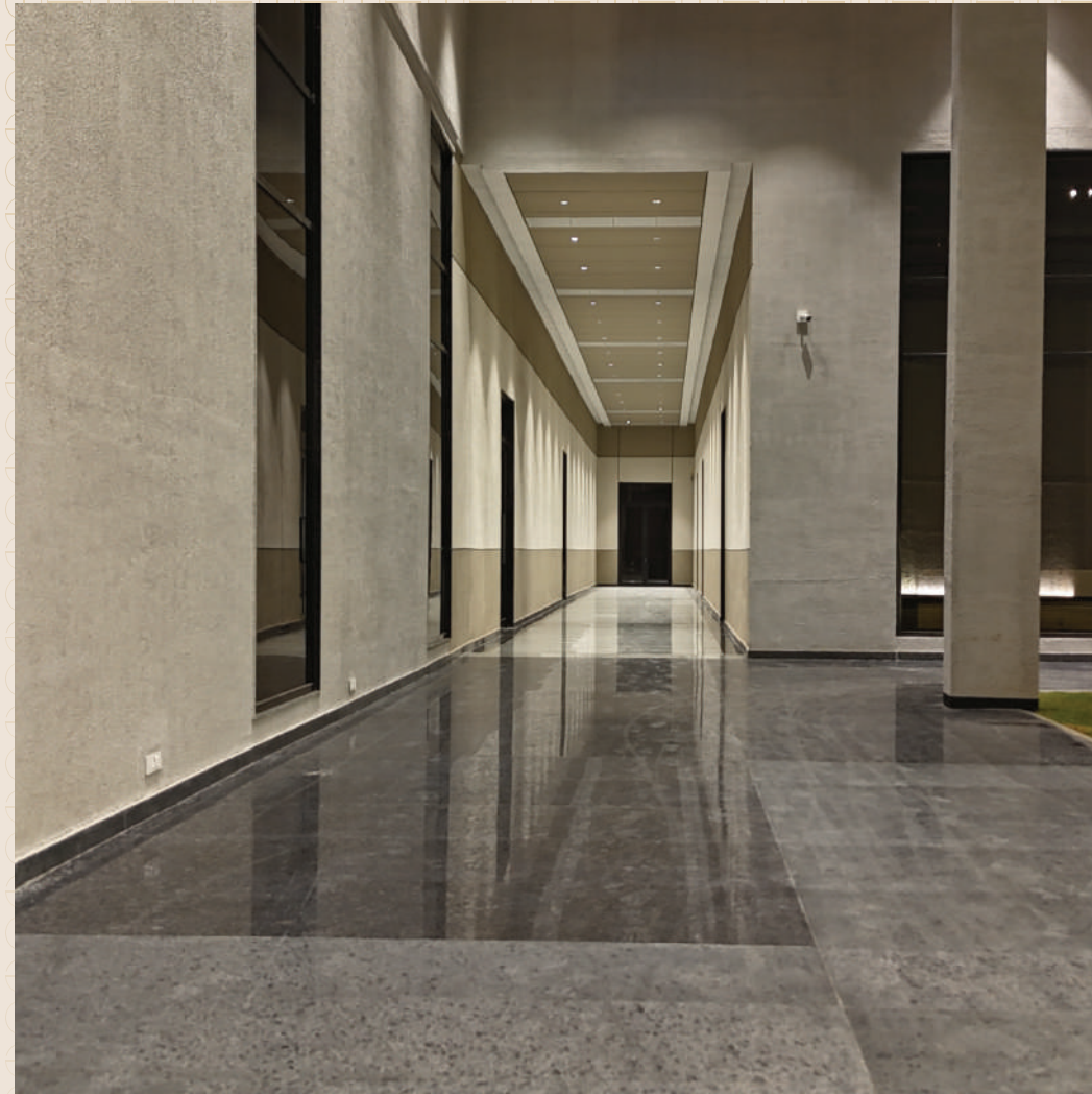
12 FT WIDE CORRIDOR